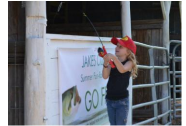
Go Fish for a Prize!