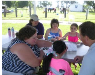
Bible Craft Fun!