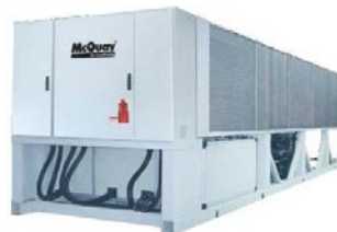
Air Cooled Screw Chiller - China Model : UAA-R22/R407 Cap. 46 to 390 TR