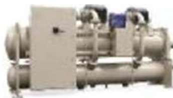
Magnetic Bearing Chiller-China Model : HTM - R134a Capacity : 125 to 400 TR