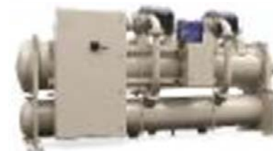
Magnetic Bearing Chiller-USA Model : WMC - R134a Capacity : 125 to 400 TR