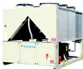
Air Cooled Screw Chiller - Italy Model : EWAD-D-R134a Cap. 50 to 170 TR