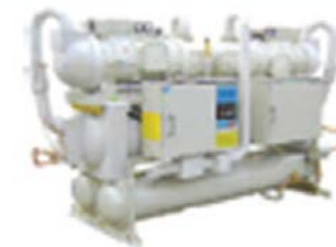
Water Cooled Screw Chiller - China Model : CUW - R22 Capacity : 39 to 346 TR