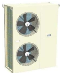
Mini Chiller - Malaysia Model : UAE-R22 Cap. : 1.5 to 11.5 TR

Authorized Dealer of Daikin & McQuay PT Enercon Equipment Company www.enercon.co.id