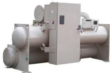
Water Cooled Centrifugal Chiller-China Model : HTS - R134a Capacity : 300 to 1500 TR

Authorized Dealer of Daikin & McQuay PT Enercon Equipment Company www.enercon.co.id