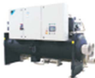
Water Cooled Screw Chiller - China Model : ZUW-CM - R134a Capacity : 110 to 490 TR