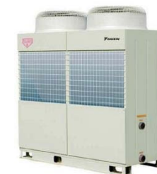
Air Cooled Modular Chiller China Model : UAL-R410 Cap. 17 to 148 TR