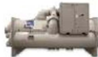
Magnetic Bearing Chiller-USA Model : WME - R134a Capacity : 400 to 700 TR