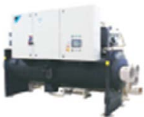
Water Cooled Screw Chiller - China Model : ZUW-DM - R134a Capacity : 99 to 304 TR

Authorized Dealer of Daikin & McQuay PT Enercon Equipment Company www.enercon.co.id