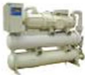
Water Cooled Screw Chiller - China Model : CUWD - R134a Capacity : 38 to 350 TR