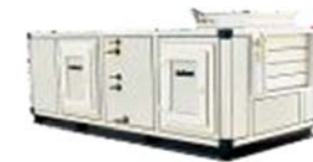
AIR HANDLING UNIT