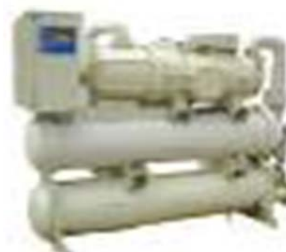
Water Cooled Heat Recovery - China Model : CUWD-HR - R134a Capacity : 38 to 461 TR