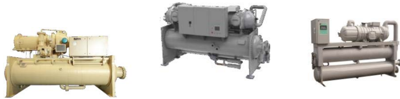
WATER COOLED CHILLER

Authorized Dealer of Daikin & McQuay PT Enercon Equipment Company www.enercon.co.id