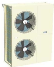
Air Cooled Modular Chiller - Malaysia Model : UAP-R407C Cap. 1.9 to 11.4 TR