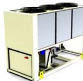
Air Cooled Screw Chiller - China Model : EWAD-R410 Cap. 28 to 117 TR