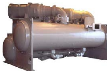
Water Cooled Centrifugal Chiller-USA Model : WDC - R134a Capacity : 600 to 2600 TR