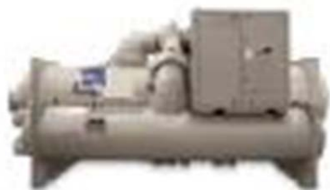
Magnetic Bearing Chiller-China Model : HTE - R134a Capacity : 400 to 700 TR