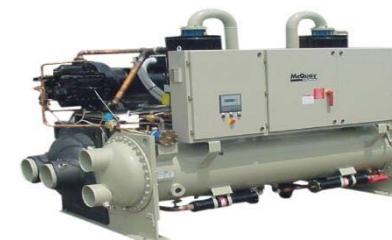
Water Cooled Screw Chiller - Italy Model : EWWD - R134a Capacity : 105 to 299 TR