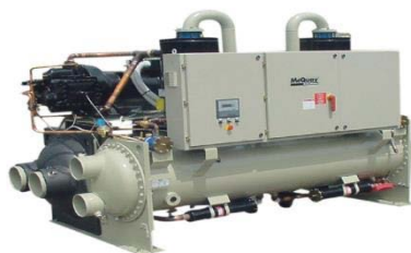
Water Cooled Screw Chiller Model : EWWQ - R410 Capacity : 108 to 600 TR