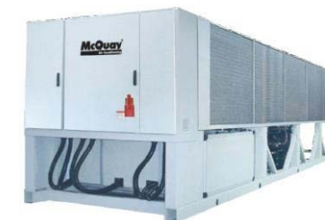
Air Cooled Screw Chiller - China Model : UAA-R134a Cap. 105 to 456 TR