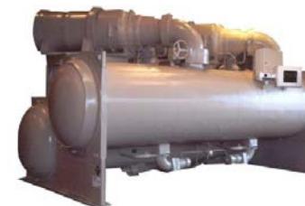
Water Cooled Centrifugal Chiller-China Model : HTD - R134a Capacity : 600 to 2600 TR