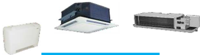
FAN COIL UNIT