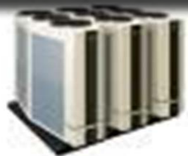
Air Cooled Modular Chiller - China Model : UAL-AR5 - R410 Cap. 28 to 560 TR