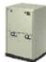
Water Cooled Scroll - China Model : UWP- R407 Capacity : 2 to 23 TR