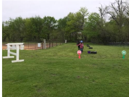
Two of four 2017 riding areas!