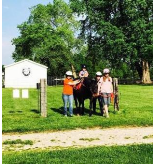
New opening into existing arena!