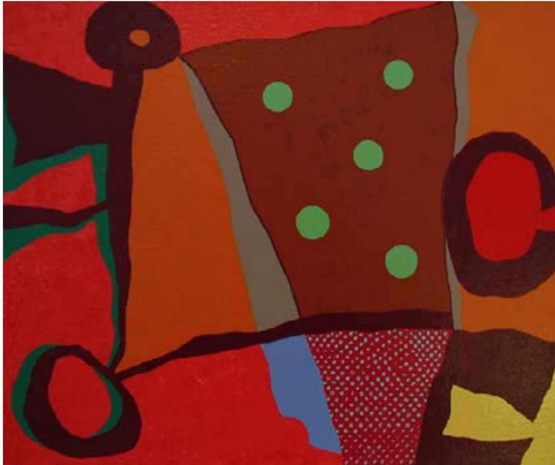
Clyde Hopkins From Gorky's Dustbin 3 2006 Screenprint Edition size: 35 Image size: 30 x 36cm Paper size: 46.5 x 51.5cm Unframed price: £660 Framed print in exhibition: £1,000