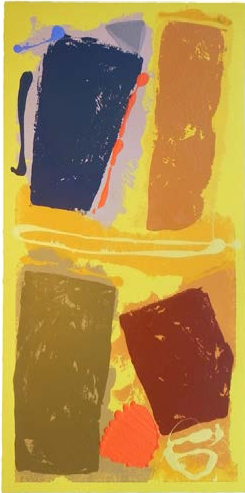
Anthony Frost Louisiana (Copenhagen Series) V 2012 Screenprint with woodblock Monoprint Paper size: 156 x 78cm Framed print in exhibition: £5,500