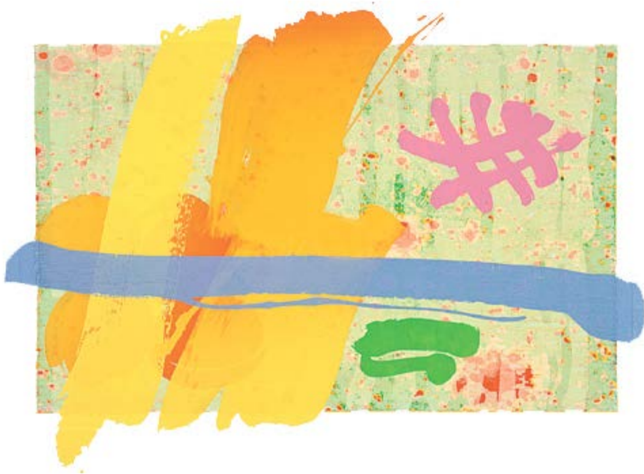
Albert Irvin OBE RA Concordia III 1997 Screenprint with woodblock Edition size: 195 Image size: 31.5 x 50cm Paper size: 52 x 68.5cm Unframed price: £900 Framed print in exhibition: £1,200