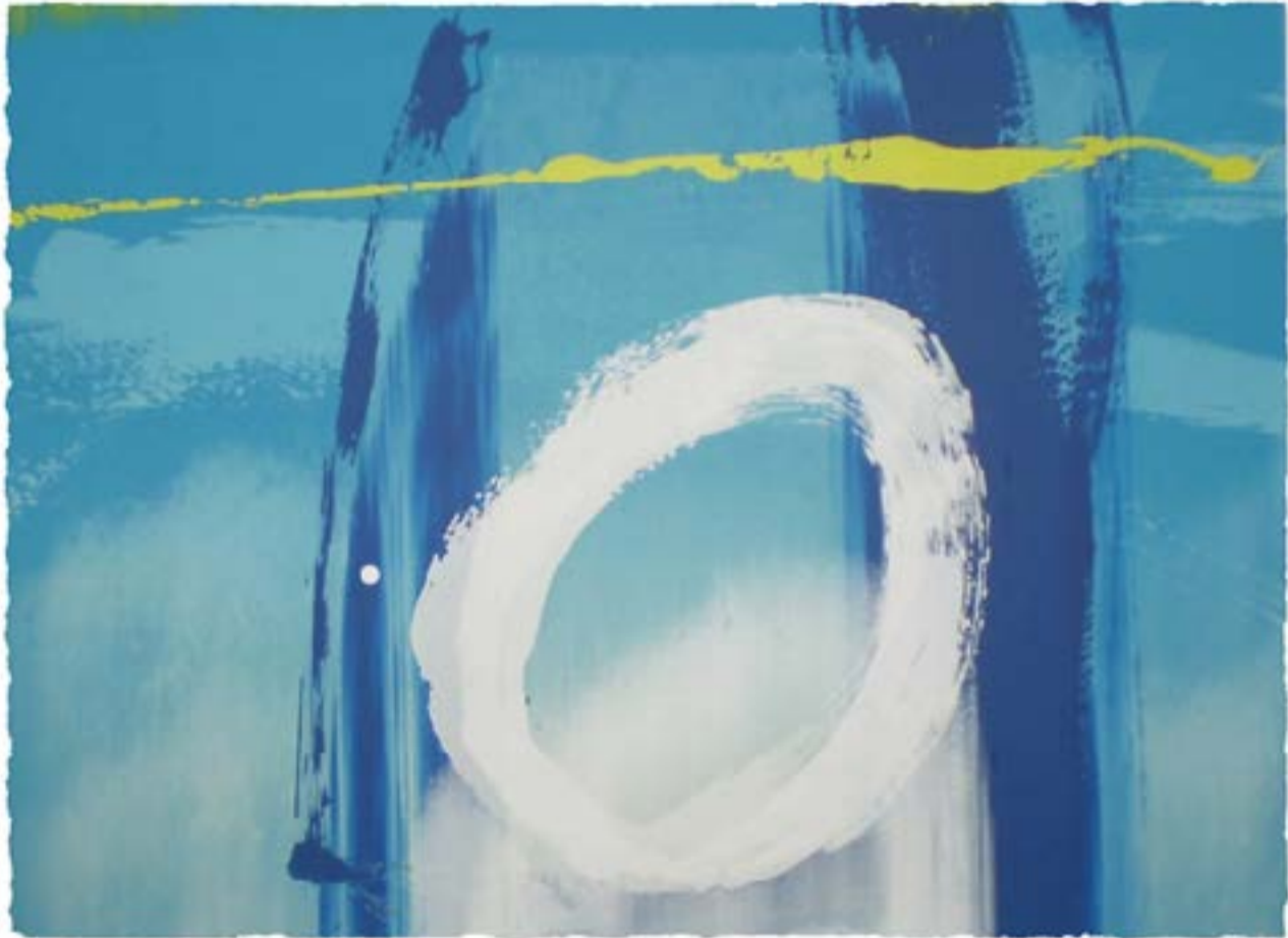
Neil Canning Frontera X 2010 Screenprint with woodblock Monoprint Image and paper size: 44.5 x 61cm Framed print in exhibition: £1,750