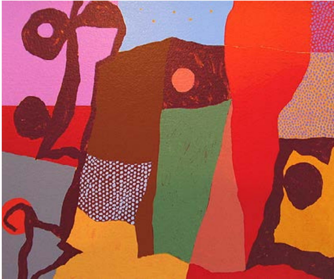
Clyde Hopkins After Gorky's Dustbin 1 2006 Screenprint Edition size: 35 Image size: 30 x 36cm Paper size: 46.5 x 51.5cm Unframed price: £660 Framed print in exhibition: £1,000