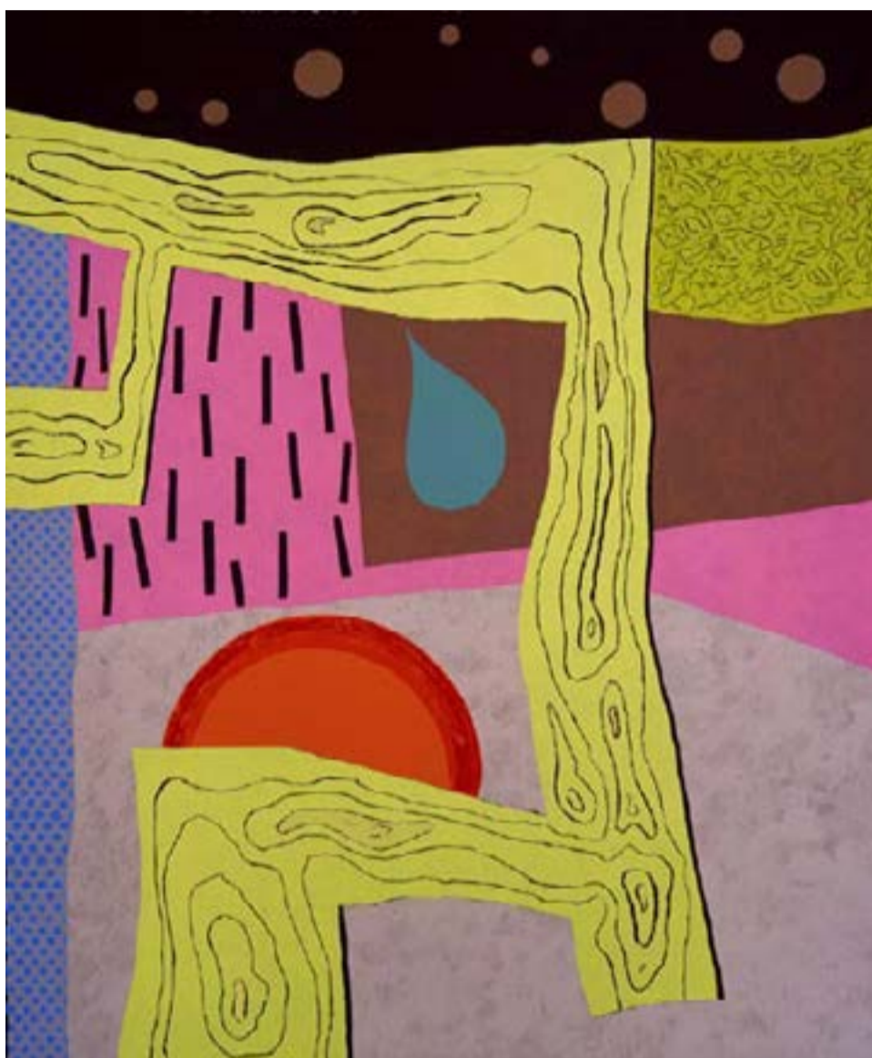
Clyde Hopkins Building a New World 2004 Screenprint Edition size: 50 Image and paper size: 61 x 50.75cm Unframed price: £900 Framed print in exhibition: £1,350