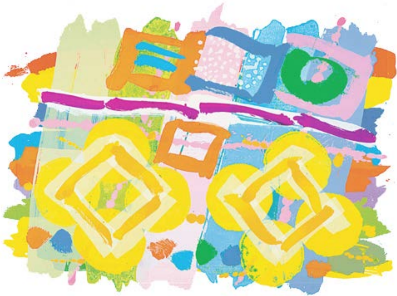
Albert Irvin OBE RA Deptford III 2000 Screenprint with woodblock Edition size: 125 Image size: 60 x 86.5cm Paper size: 76 x 101.5cm Unframed price: £1,140 Framed print in exhibition £1,400