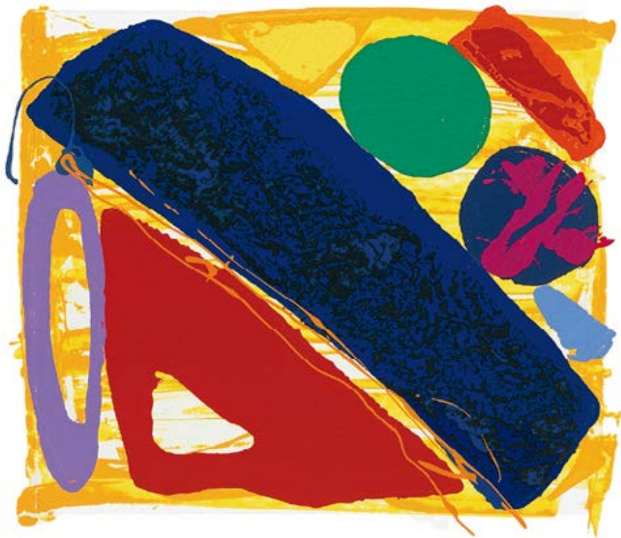
Anthony Frost Printhead 2009 Screenprint with woodblock Edition size: 75 Image size: 33 x 35cm Paper size: 49.5 x 52cm Unframed price: £720 Framed print in exhibition: £950