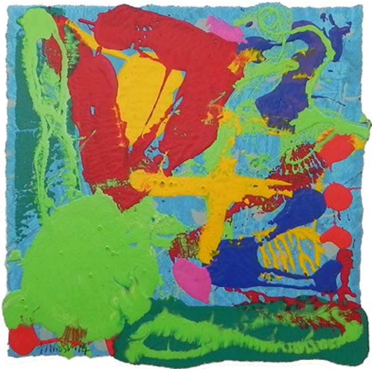
Anthony Frost Santa Fe XV 2014 Screenprint with woodblock Monoprint Paper size: 35.5 x 35.5cm Framed print in exhibition: £1,750