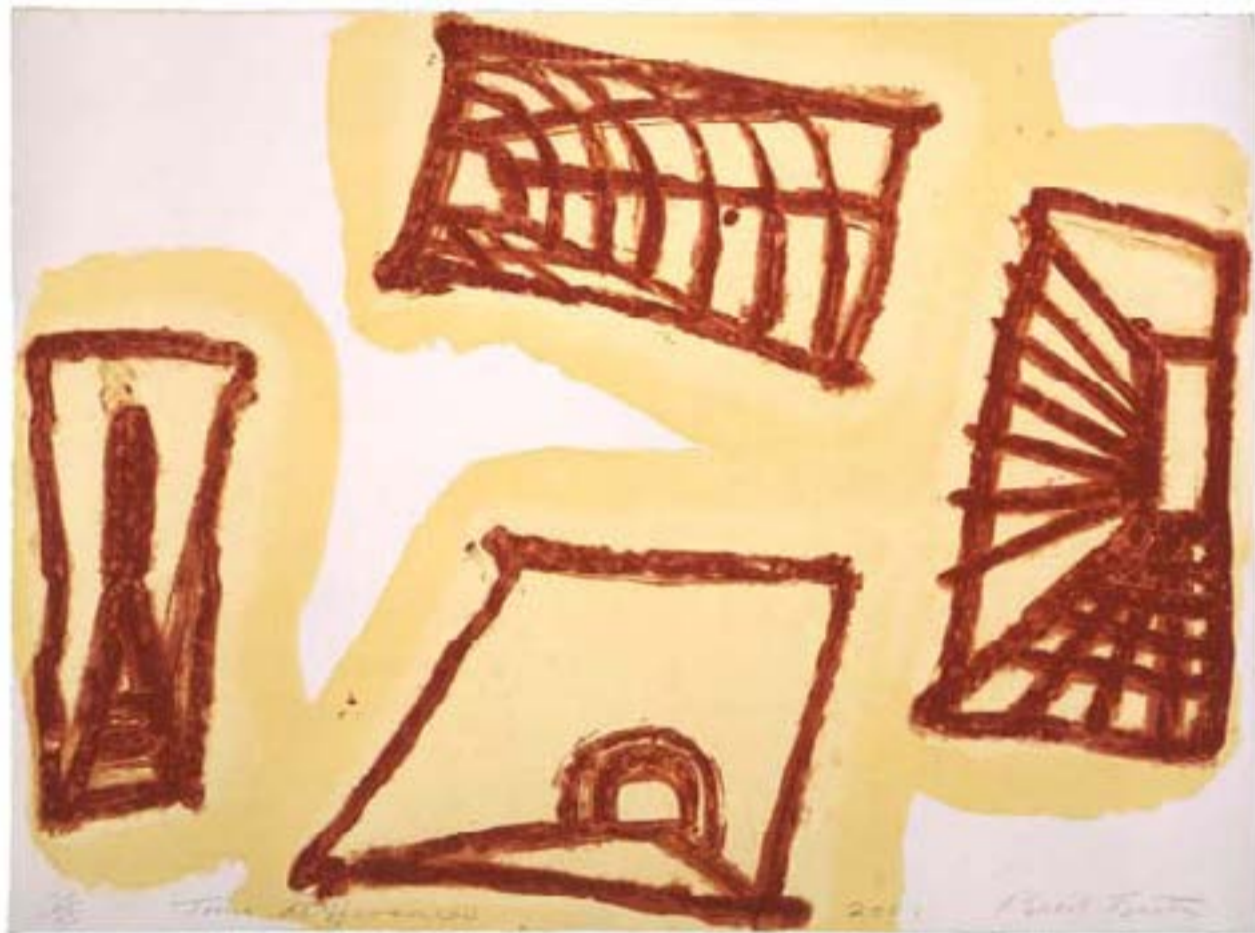
Basil Beattie RA Time Differences 2001 Screenprint Edition size: 35 Image and paper size: 58.5 x 78.5cm Unframed price: £780 Framed print in exhibition: £1,100