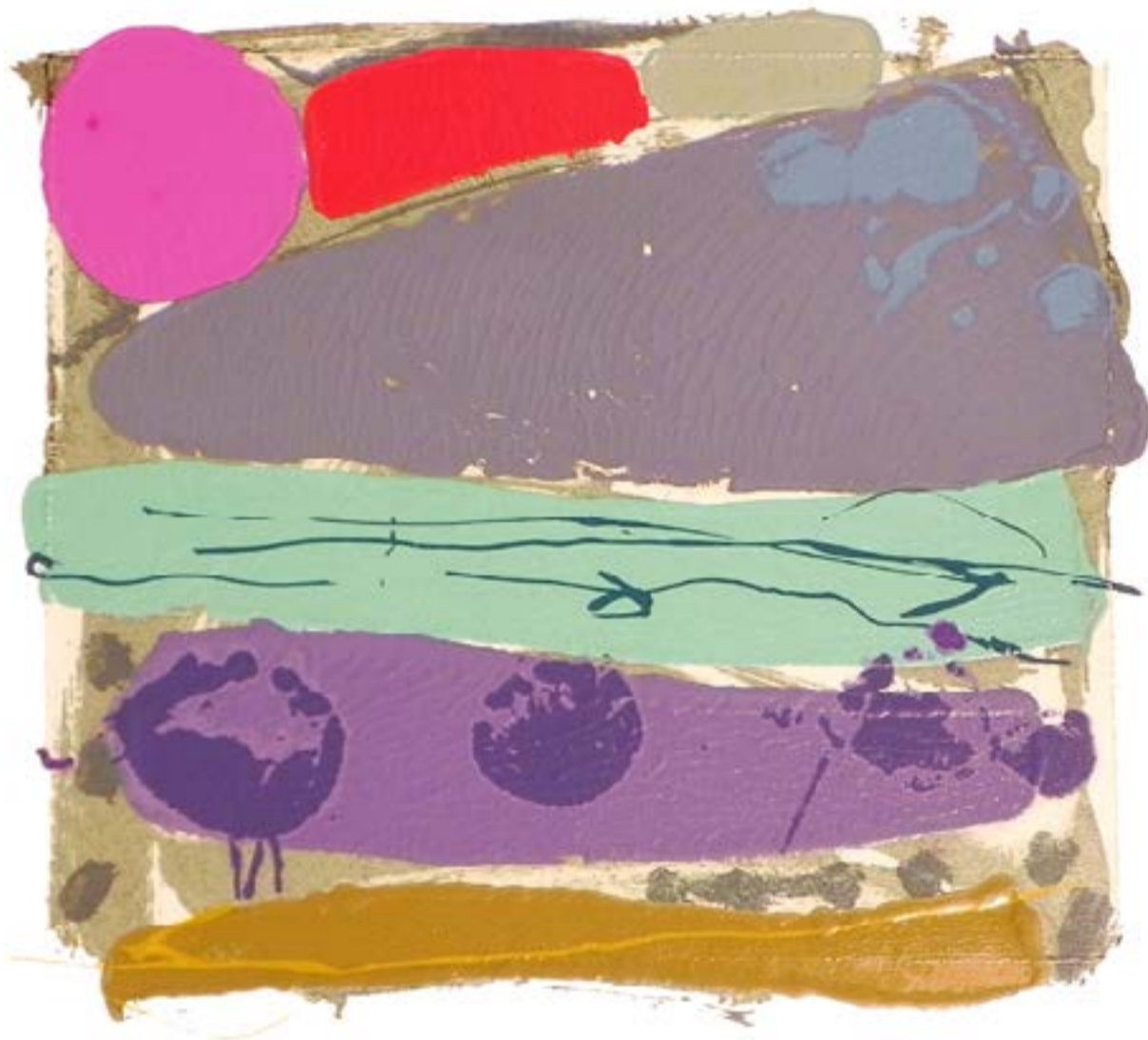
Anthony Frost Magnetic Fields 2010 Screenprint with woodblock Edition size: 75 Image size: 33 x 35cm Paper size: 49.5 x 52cm Unframed price: £720 Framed print in exhibition: £950