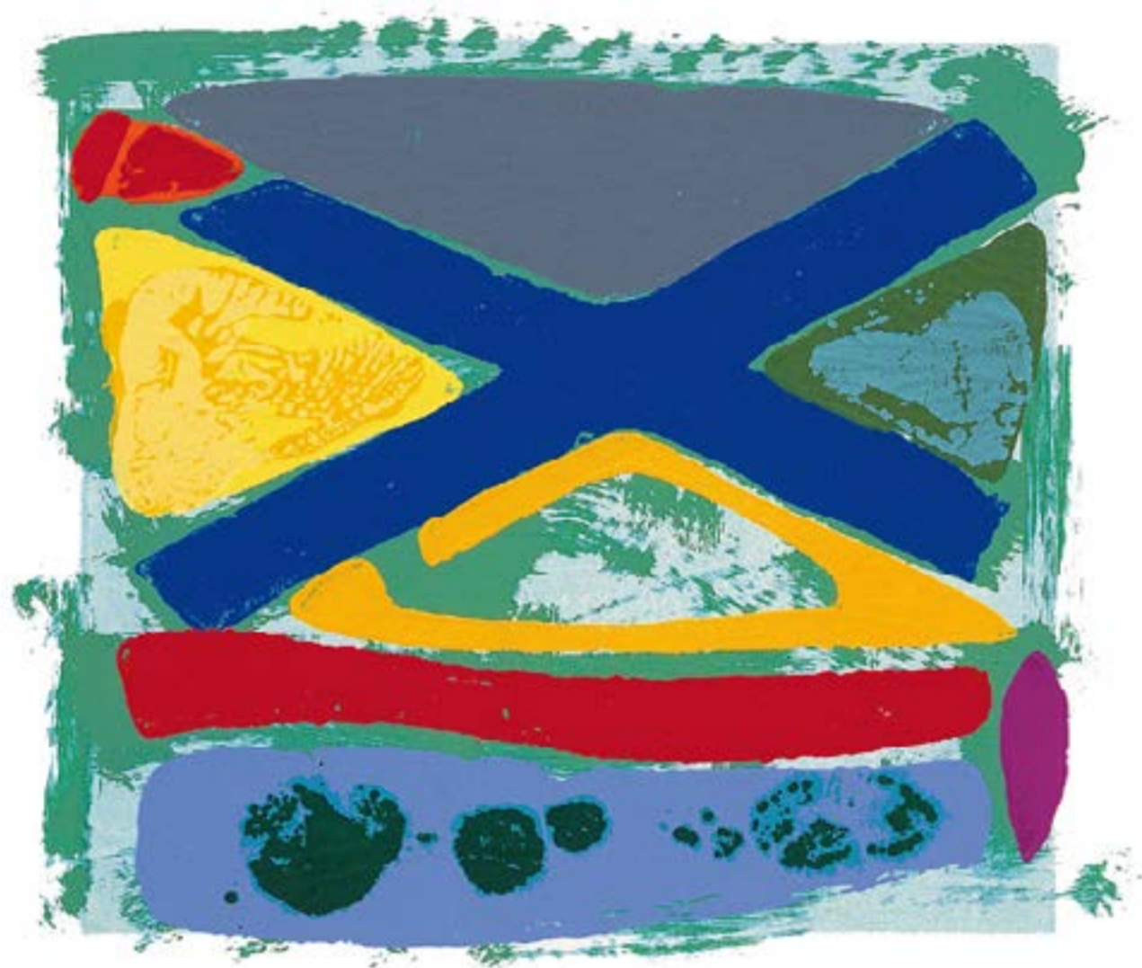
Anthony Frost Green Blues 2009 Screenprint with woodblock Edition size: 75 Image size: 33 x 35cm Paper size: 49.5 x 52cm Unframed price: £720 Framed print in exhibition: £950