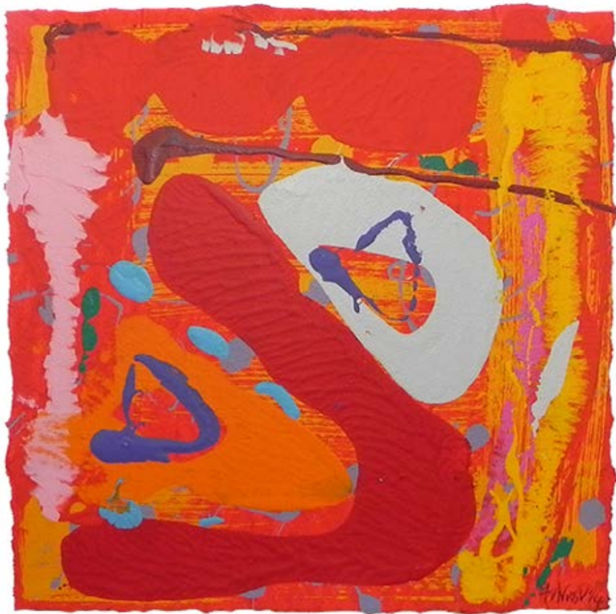
Anthony Frost Santa Fe VII 2014 Screenprint with woodblock Monoprint Paper size: 35.5 x 35.5cm Framed print in exhibition: £1,750