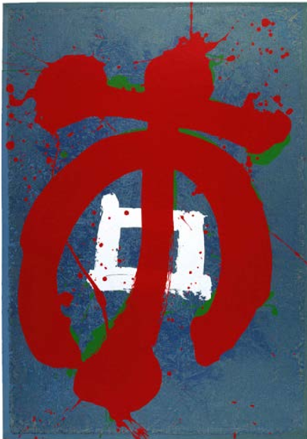
John Hoyland RA First Man 1993 Screenprint with woodblock Edition size: 90 Image size: 84 x 59cm Paper size: 112 x 84.5cm Unframed price: £1,800 Framed print in exhibition: £2,200