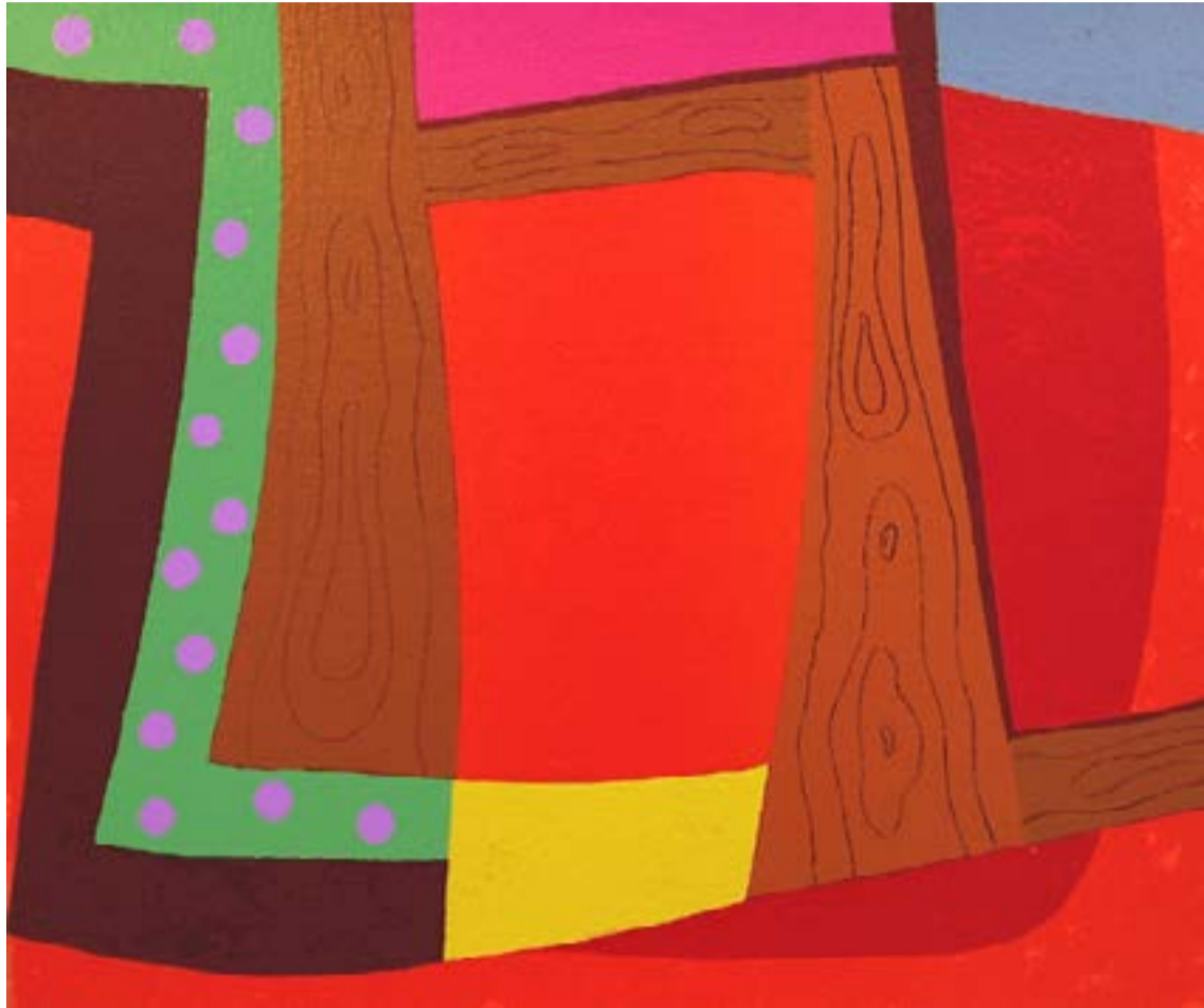
Clyde Hopkins Plankhead 2006 Screenprint Edition size: 35 Image size: 30 x 36cm Paper size: 46.5 x 51.5cm Unframed price: £660 Framed print in exhibition: £1,000