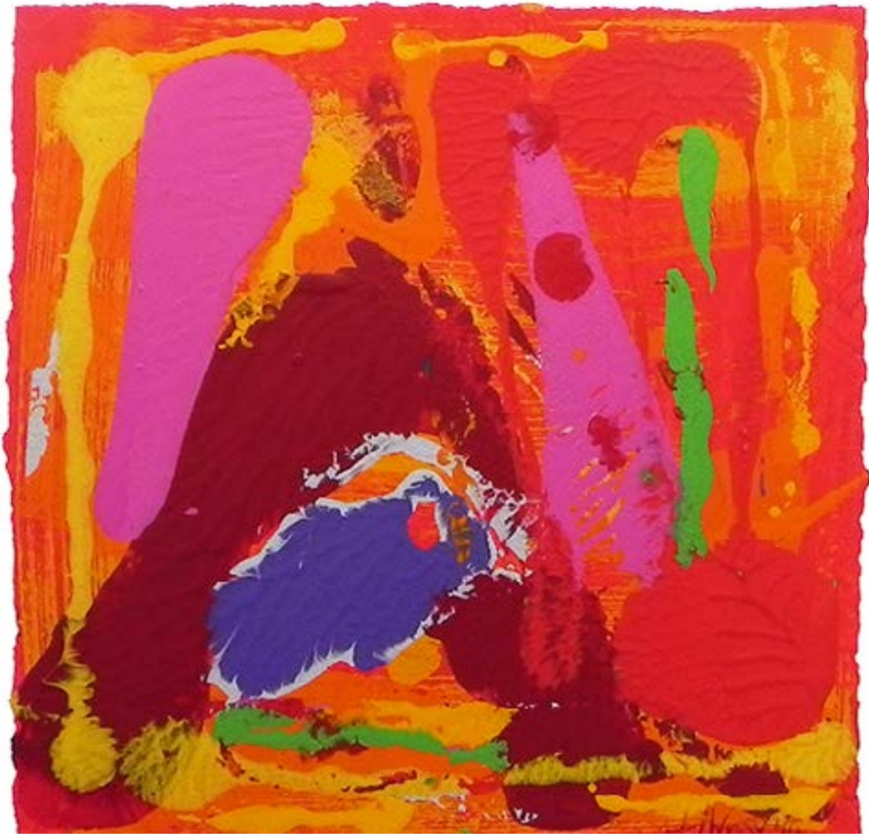
Anthony Frost Santa Fe XXIV 2014 Screenprint with woodblock Monoprint Paper size: 35.5 x 35.5cm Framed print in exhibition: £1,750