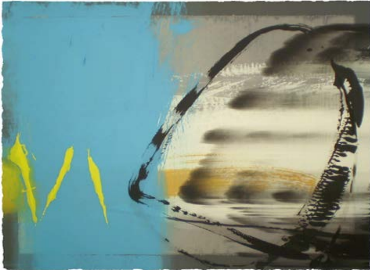
Neil Canning Frontera VIII 2010 Screenprint with woodblock Monoprint Image and paper size: 44.5 x 61cm Framed print in exhibition: £1,750