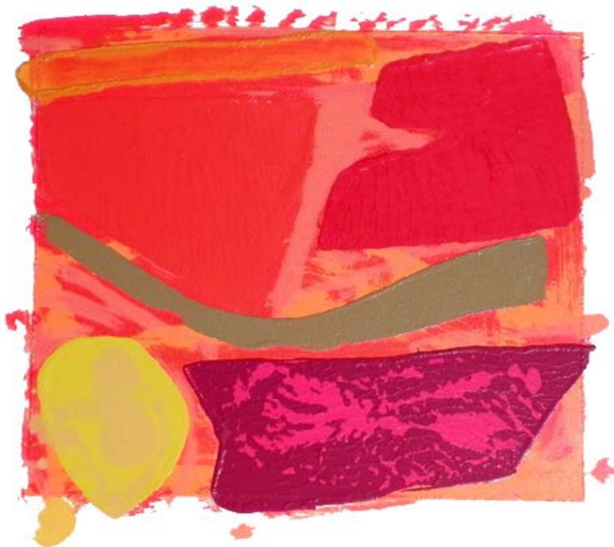
Anthony Frost Orange Buzz Ohio 2010 Screenprint with woodblock Edition size: 75 Image size: 33 x 35cm Paper size: 49.5 x 52cm Unframed price: £720 Framed print in exhibition: £950